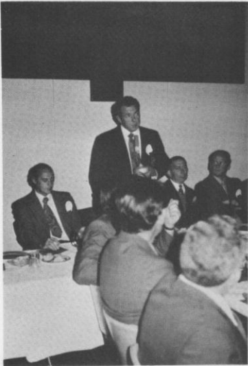
Who said the President couldn't talk.