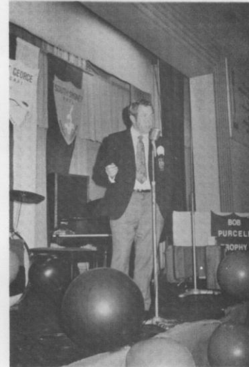
The President at it again.