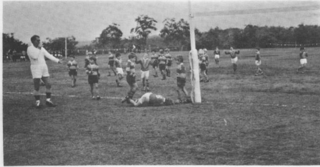
"Father" does his thing.