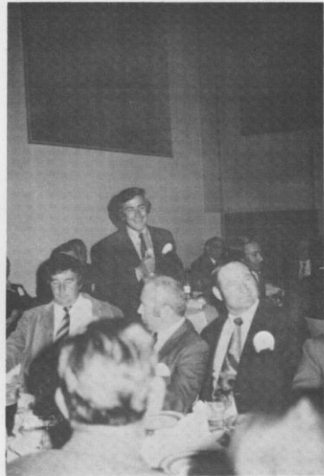
The Journalists have their say.