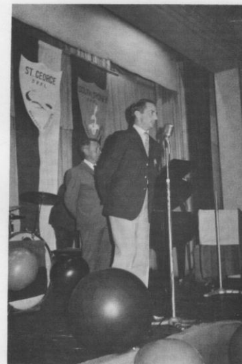
Our Secretary in a serious mood.