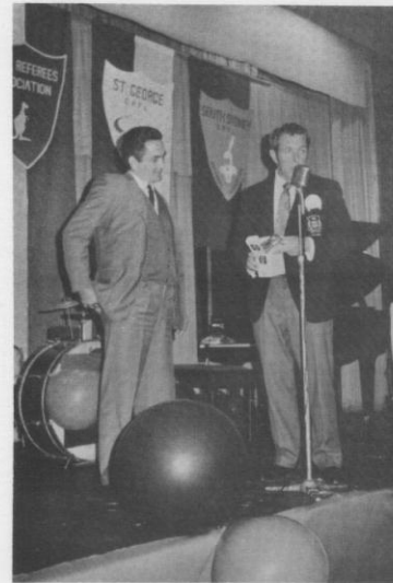
Last year's "R. Purcell Trophy" winner.