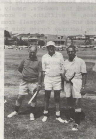
One of the best teams to work together for the year at the Combined Referees Knockout 1975.