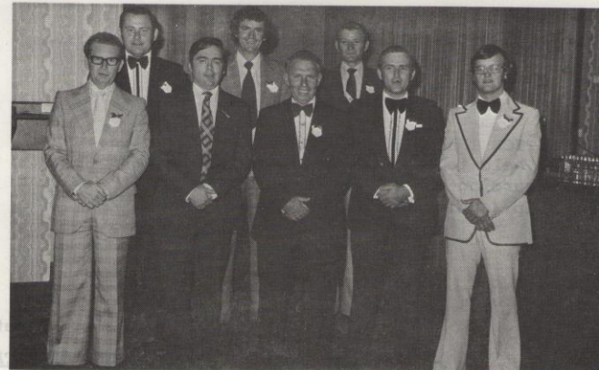
FATHER AND HIS BOYS