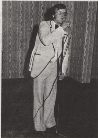
M. C. and Social Secretary looking debonaire.

No doubt the highlight of the year was our Christmas Ladies Night held at the Castle Hill R.S.L. We entertained over 100 people, amongst these were guests from every affiliated Association.