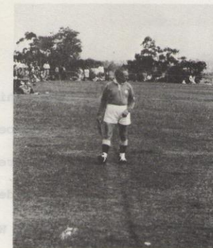
Father doing his usual job