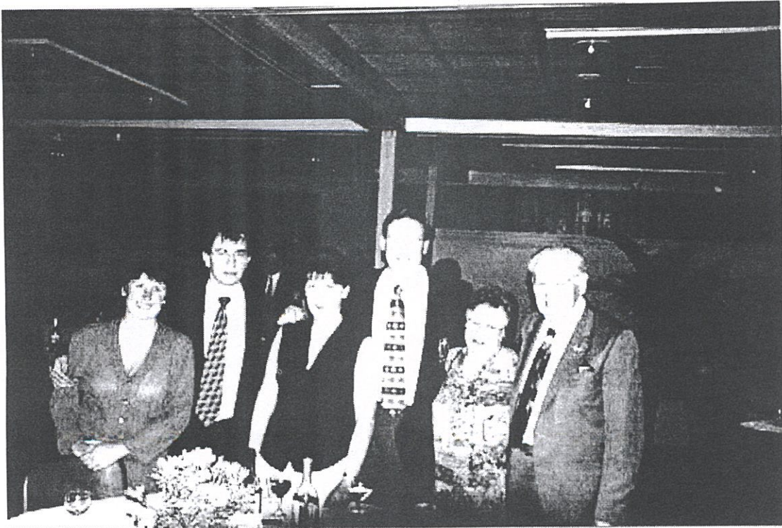
The Ryan Party enjoy themselves