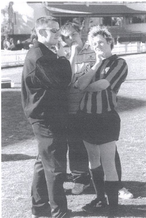
Hhhmmmm...we can only guess what these guys are thinking!!!