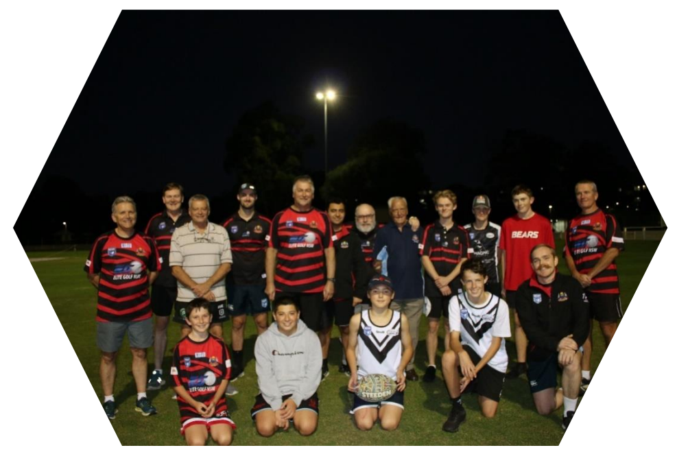
Team Photo – All eager for the new season.